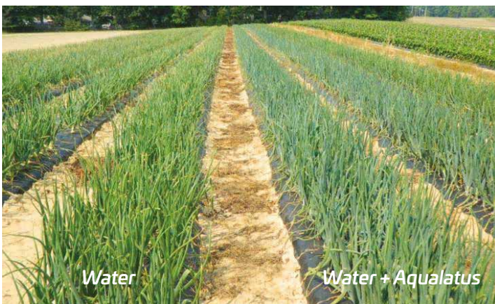
Aqualatus treated onions

In the case of extreme dry conditions or for use in hydrophobic soils or growing substrates additional applications may be used.